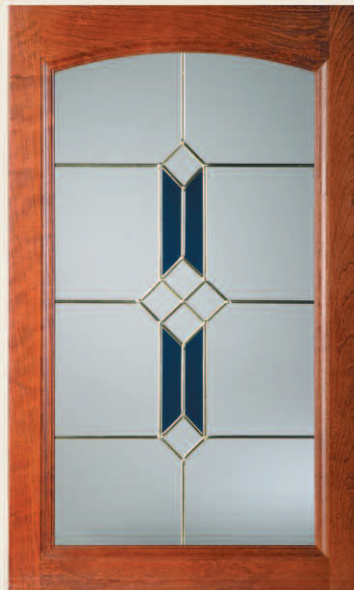
INCA (AS PICTURED)

Green border around center diamond Clear Pebble upper, middle and lower diamond Glue Chip background Brass Lead