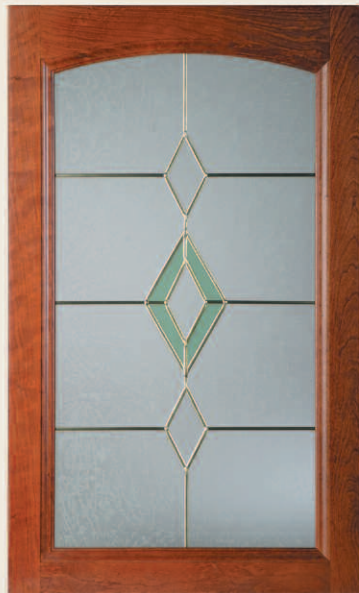
AZTEC (AS PICTURED)

Green border around center diamond Clear Pebble upper, middle and lower diamond Glue Chip background Brass Lead