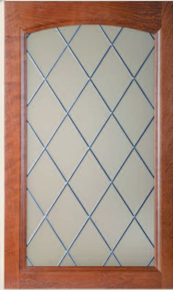
CATHEDRAL (AS PICTURED)

Kivi diamonds and border Glue Chip background Platinum Lead