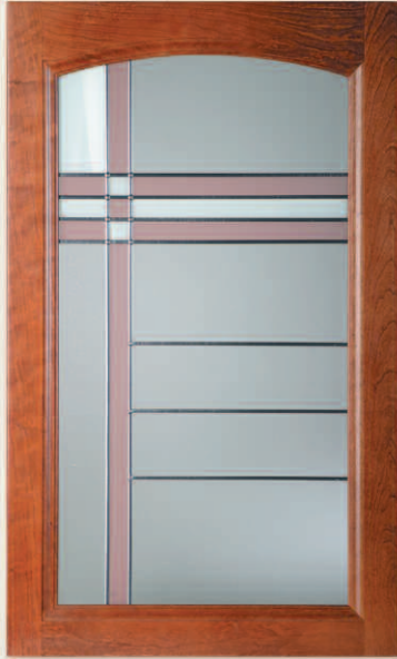
CHELSEA (AS PICTURED)

Rose striping with milky white inset Clear Pebble background Platinum Lead