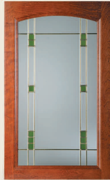
TRIBECA (AS PICTURED)

Rust squares on stripes Clear vertical stripes Beige background Brass Lead