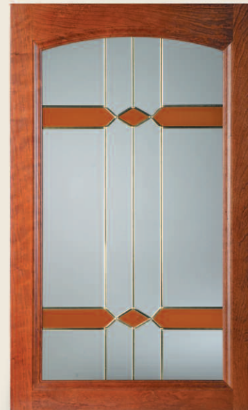
DYNASTY (AS PICTURED)

Navy Blue center stripe Clear diamonds Mist background