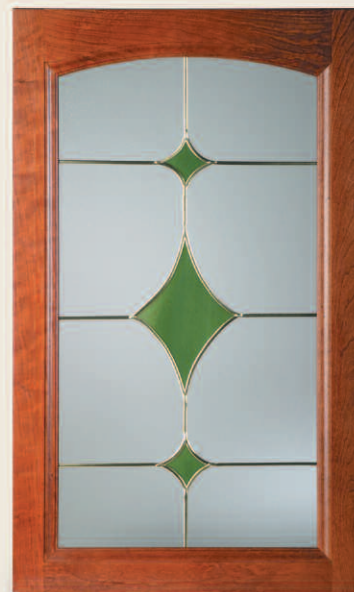
PREMIER (AS PICTURED)

Sea Blue Diamonds Obscure Pebble background Platinum Lead