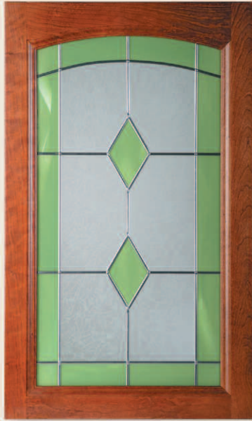
HERITAGE (AS PICTURED)

Kivi diamonds and border Glue Chip background Platinum Lead