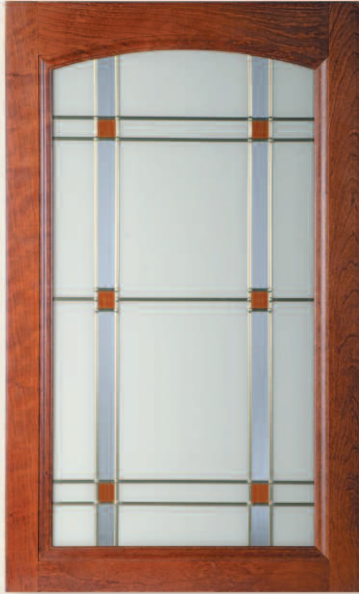
SOHO (AS PICTURED)

Rust squares on stripes Clear vertical stripes Beige background Brass Lead