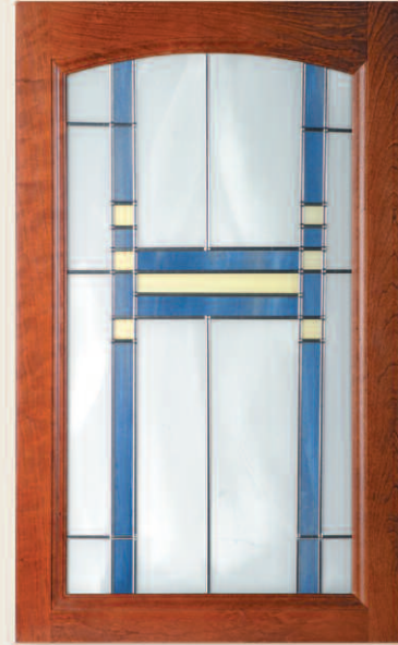
MANHATTAN (AS PICTURED)

Rose striping with milky white inset Clear Pebble background Platinum Lead