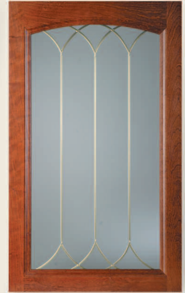
SOVEREIGN (AS PICTURED)