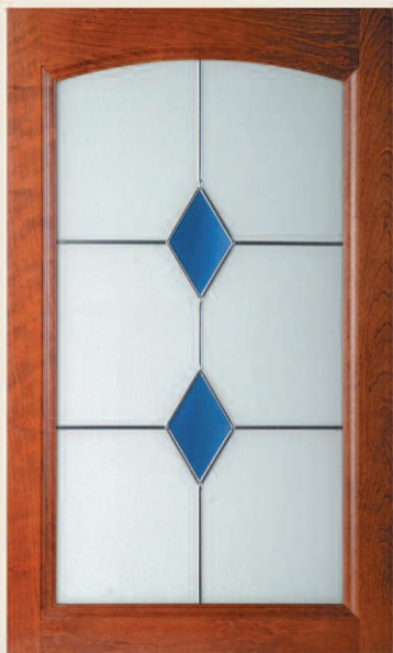
CLASSIC (AS PICTURED)

Sea Blue Diamonds Obscure Pebble background Platinum Lead